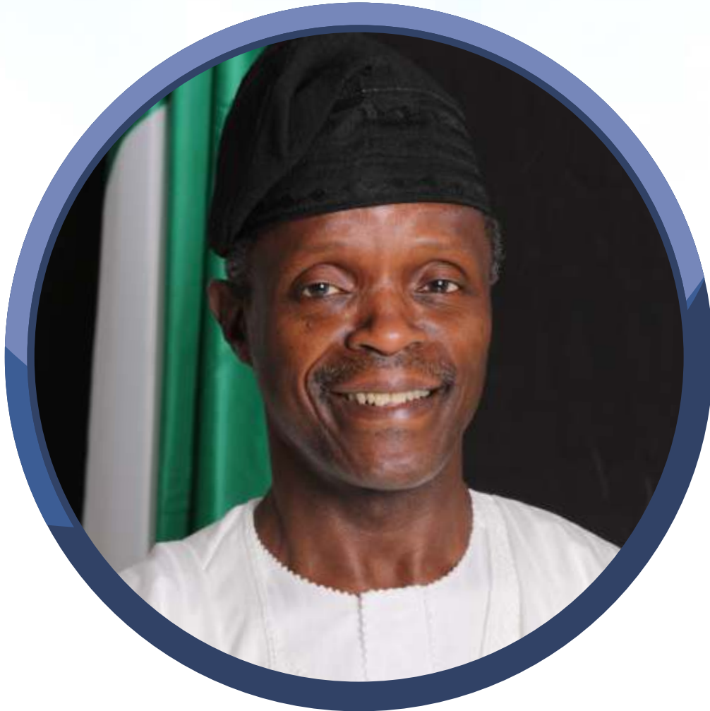
HIS EXCELLENCY PROFESSOR YEMI OSIBANJO VICE PRESIDENT, FEDERAL REPUBLIC OF NIGERIA