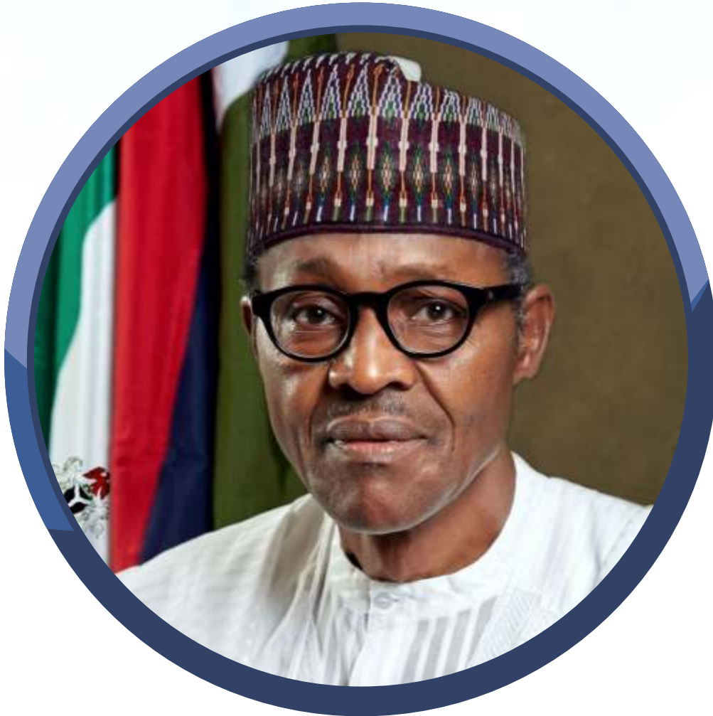
HIS EXCELLENCY MUHAMMADU BUHARI GCFR PRESIDENT, COMMANDER-IN-CHIEF OF THE ARMED FORCES OF FEDERAL REPUBLIC OF NIGERIA