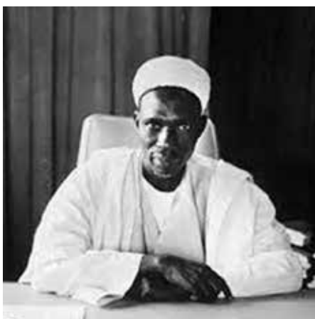
Tafawa Balewa. First Nigerian Prime Minister

The common perception of the string of administrations that have governed the affairs of Nigerians from the first republic to the present is that of incompetence borne out of inexperience and compounded by the absence of appropriate social and legal institutions to guide good public policy and conscribe policy makers. A generous view of the leadership at the federal and state level is one of innocent naïvete but crooked. Lacking in refined formal education and requisite experience, successive administrators may be excused for the disastrous policies that have consistently retarded the nation's development and sustained all manners of pervasive social fractures and discontent. Such views of Nigerian leaders are inaccurate and wide of the mark.