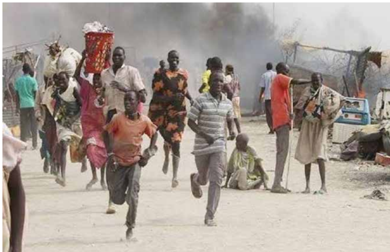
Bomb blasts from terrorist groups provide deadly distractions from crippling poverty and high unemployment

Traders in the retail industry, farmers, private fisheries operators, proprietors of transportation chains, small and mid-size producers of goods and services trapped in a system that deprives them the ability to access working capital secured by privately held assets often fail, and ultimately join the mass of unemployables seeking government contracts in various centers of political power. This mass of unemployables, lacking in skills and access to working capital or loans from the formal sector must subsist on whatever is available. Petty crimes, kidnapping for ransom, internet scams, and terrorism become alternate professions with minimum investment in human capital. Locked out of the formal sector, the mass of unemployables and their chosen means of subsistence are the unwanted or anticipated derivatives of the leadership strategy of the Nigerian political elites. The chickens have come home to roost; the elites are no longer as safe as they once thought.