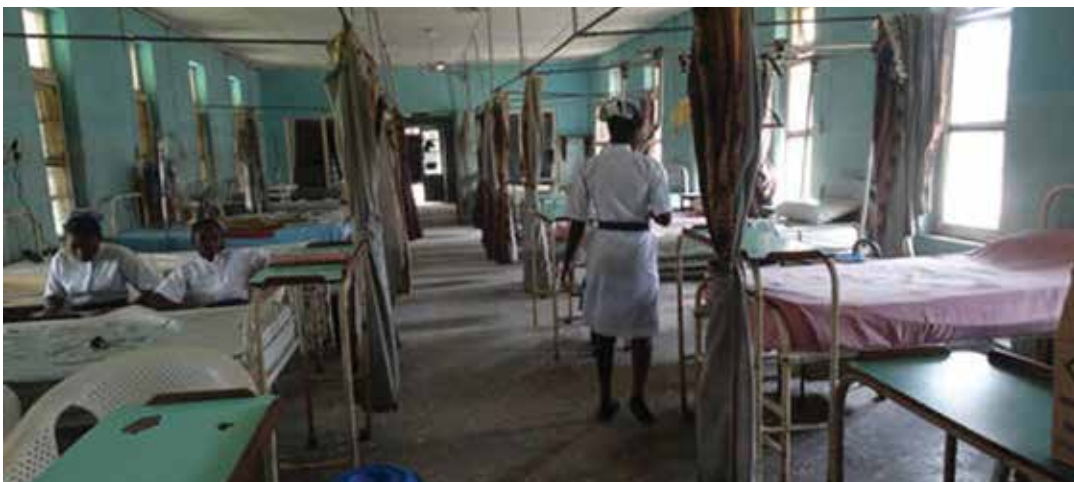
Empty beds in a hospital ward. The poor cannot afford to be here; those who can are just as worst off.

The political elites had succeeded; leave the social and economic infrastructure necessary for economic growth and knowledge acquisition in perpetual disrepair, and the Nigerian populace would remain tethered to the elites indefinitely. But this policy is self-defeating and unsustainable if the goal is to continue the myth of a unitary Nigeria layered over a host of ethnic groups with disagreeable cultural-religious sensibilities. As the economic tide that lifted all abated, the economic leash from the center has become weak and brittle. The center may not hold much longer; this outcome was inevitable.