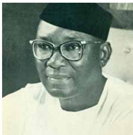
Nnamdi Azikiwe. First Nigerian President

Balewa and Azikiwe failed to see the futility of Nigeria as created by the British.