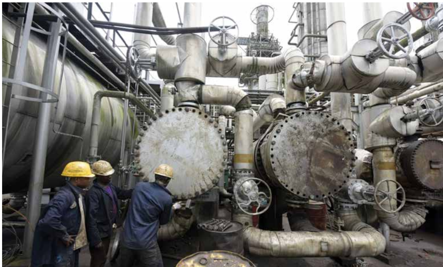
The oil boom of the 1980s / Getty images.

This political arrangement was readily accepted by Nigerians when the tide of oil boom lifted almost all willing and able participants in the national economy. The steady decline of oil revenue beginning in the 2000s shrank the national income, and as politicians and policy makers took more for themselves, existing consequential national fault lines became more visible; those without access to political power and economic resources are now asking for a new political and economic arrangement. The old norm was no longer serviceable; the nation was never one in the first instance. The pretenses to a united nation-state of Nigeria are no longer benign and harmless illusions. A course correction is now cardinally imperative.