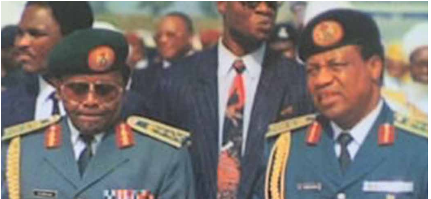
General Abacha and General Babangida

Both facilitated the moral decay and debasement of Nigeria.