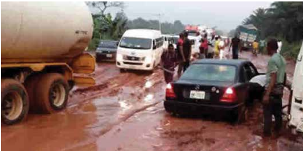
What awaits travelers on public roads.

The Orwellian 1984 fictional Newspeak is a Nigerian reality. Deprive the masses of means to self-sufficiency, give them handouts and subsidies so they remain hitched to the magnanimity of the political and economic elites, misrepresent facts to align with contrived reality, and one has the history of Nigeria's leadership. Imaginary annual budgets are misappropriated to illusory roads, schools, hospitals, electricity generation, and whatever projects can be conjured up, and make them exist in principle and in name only. Keeping existing roads and transportation infrastructure in perpetual disrepair succeeds in retarding delivery of goods and services and imposes inordinate cost on those who must use the road network; keeping electricity in constant short supply effectively hampers commercial and private activities to the point that no serious manufacturing beyond subsistent levels can be engaged; miseducating the population in sub-standard schools deprives the economy of skilled labor, and simultaneously deprives domestic industries access to high-research needed to drive technological advances and innovations.