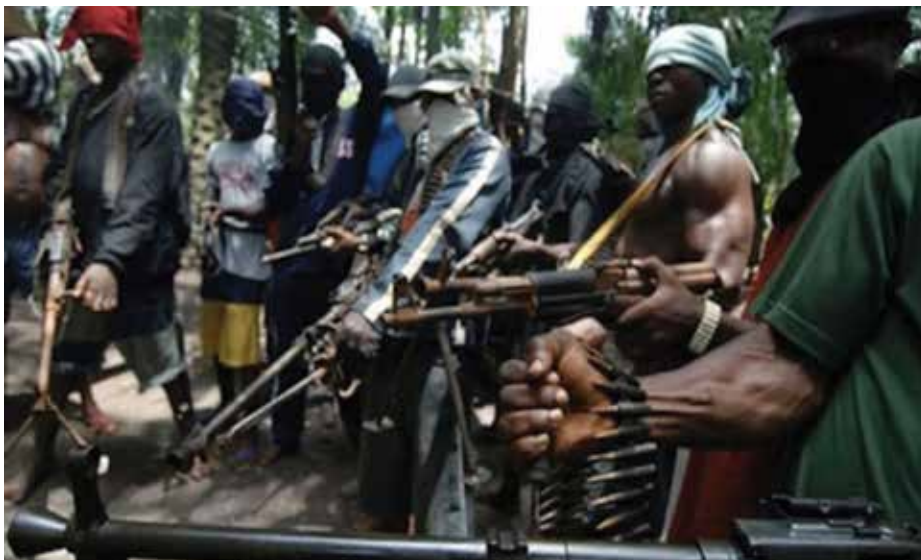
Outgunned and outmatched, terrorist groups remain resilient against Nigeria security forces

This is the final outcome of a nation-building strategy embarked upon over six decades ago by clever and self-serving elites intent on perpetual monopoly of economic and political power. Re-branding the country with a new name would not help. Perhaps allowing constituent ethnic groups to create new nation-states that reflect their various hopes and aspirations but still remain within a loosely defined confederacy may save the geo-political entity christened "Nigeria" by the British from ultimately collapsing under its rotten foundation. A constitutional conference of vested interests that leads to a national plebiscite on how to re-organize Nigeria is now imperative.